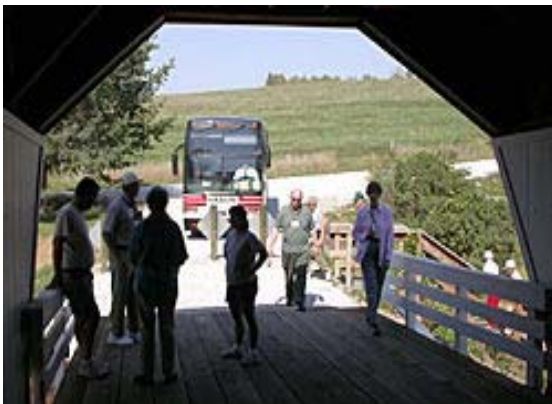
Bridges of Madison County